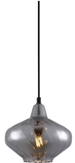
CAMPANA2 (Mirror Finish Smokey Black)